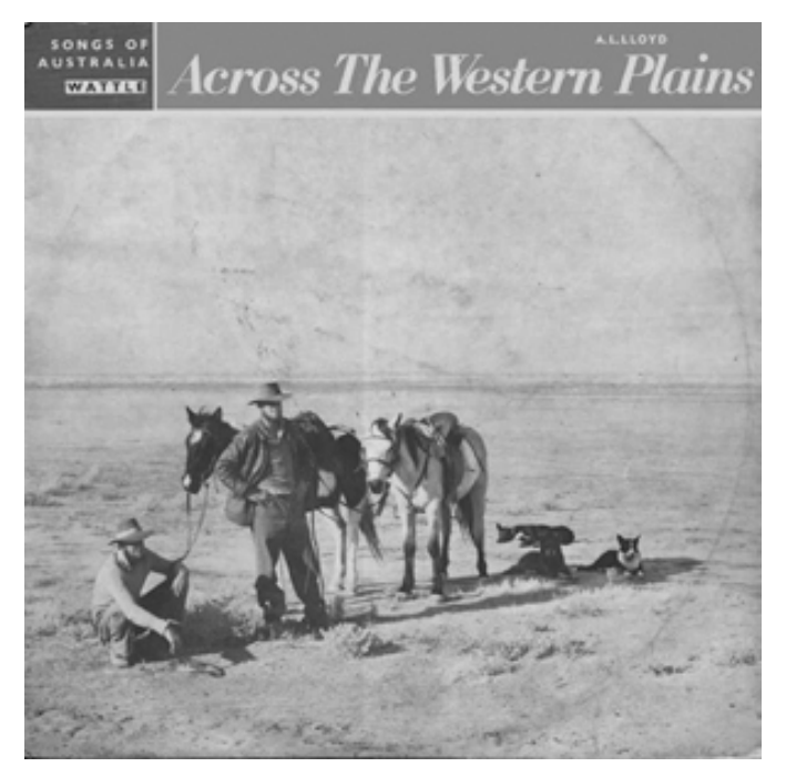
A.L. Lloyd - 1958 Wattle 12" LP